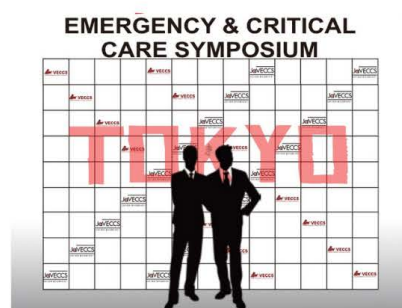
Step and Repeat backdrop at reception room